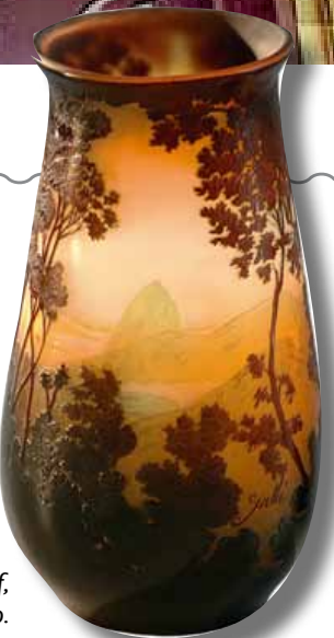
Gallé vase with Sugar Loaf, c. 1900-1930.

Participants in the three-day Pre-Congress in São Paulo will enjoy an opening reception at the 1939 Town Hall and will feast on Feijoada, the Brazilian national specialty, at a luncheon held at the 1941 Henri