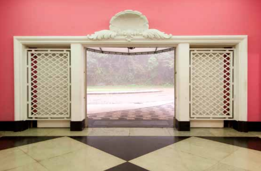
Former Casino-Hotel Quitandinha, Rio de Janeiro. Interior design by North American decorator Dorothy Draper, early 1940s. Entrance foyer, ceiling lighting fixture, theater interior.