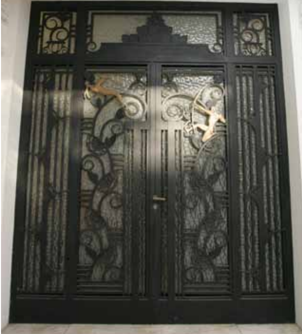
Wrought iron doors at the main entrance to Casa Basbaum, attributed to Edgar Brandt.