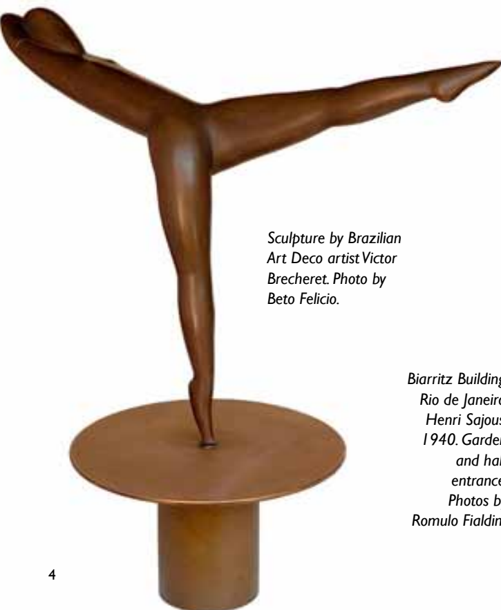
Sculpture by Brazilian Art Deco artist Victor Brecheret.