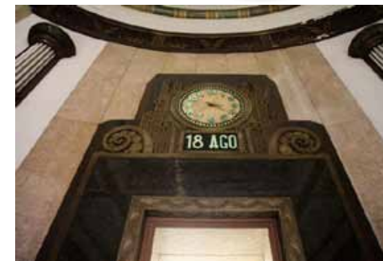
Marble, onyx, and alabaster interior of the Banco de São Paulo.