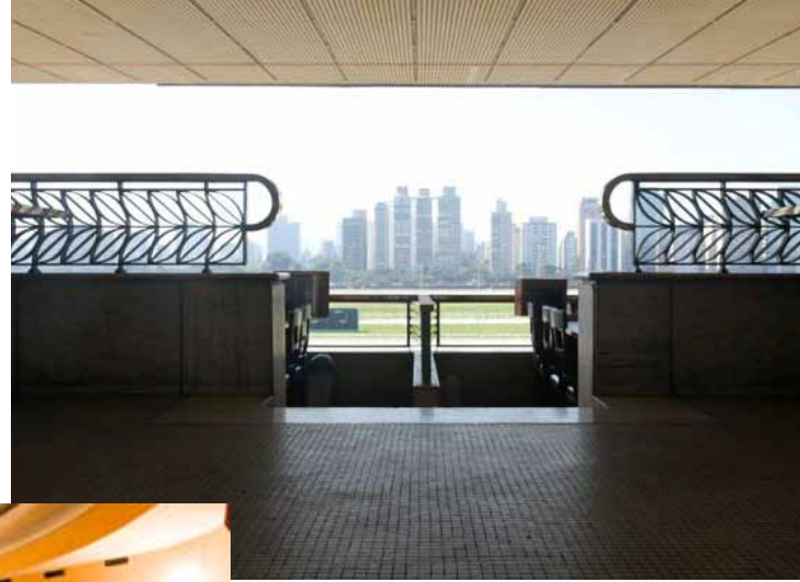
View of the racetrack at the Jockey Club with the buildings of downtown São Paulo in the distance.