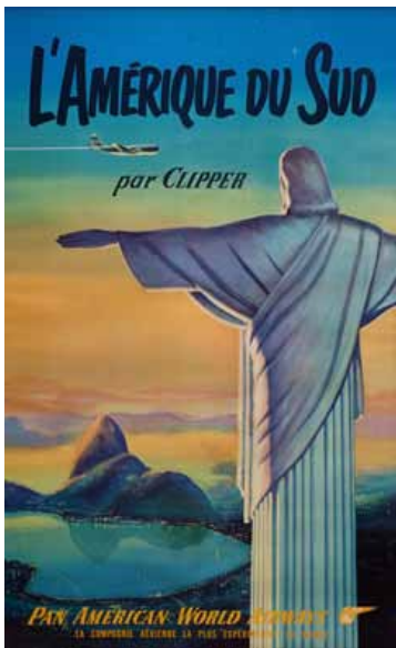
Pan American Airlines poster showing Christ the Redeemer with Sugar Loaf and Guanabara Bay, 1940s. Photo by Beto Felicio.